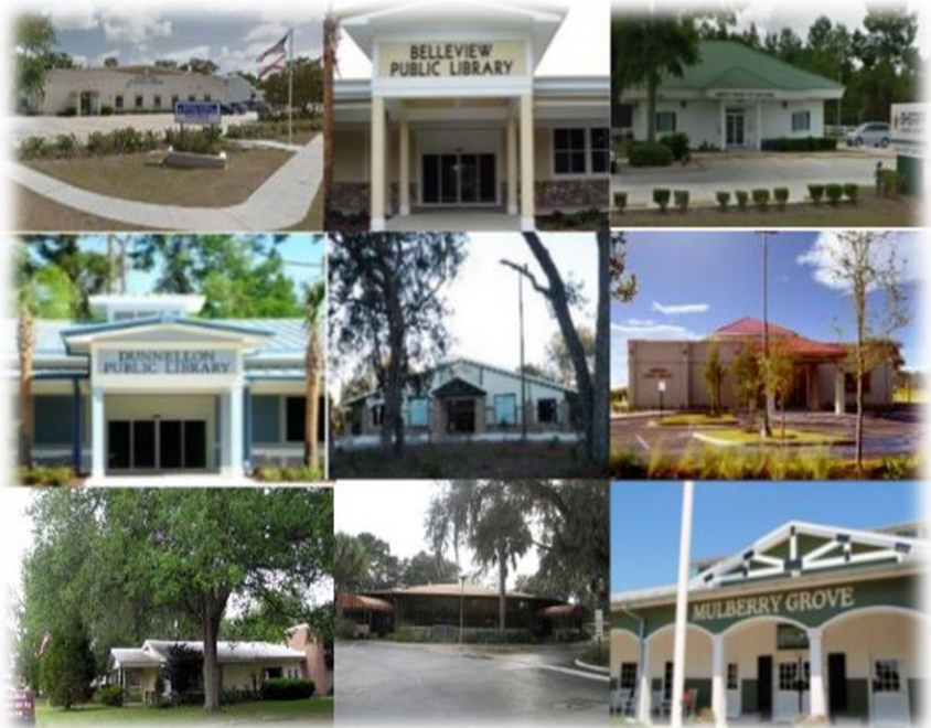
Marion County's 9 Early Voting Sites

Photo and signature ID required to vote in Florida Polls are open on Election Day 7:00 AM to 7:00 PM