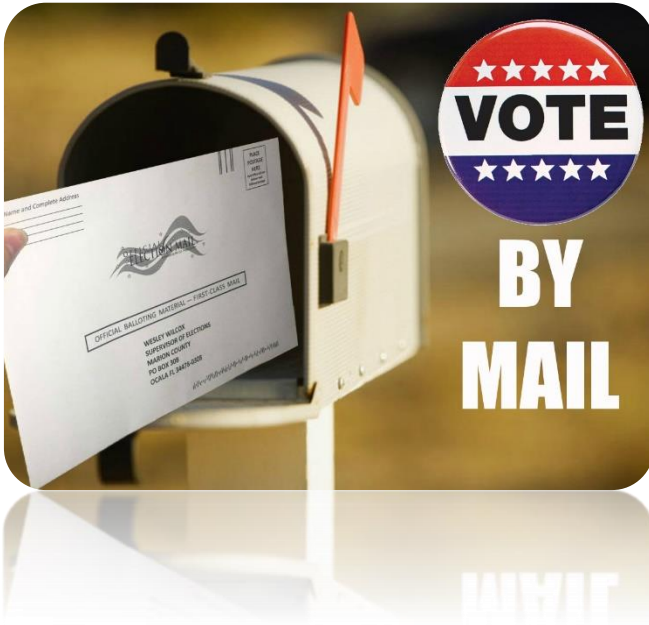
Photo and signature ID required to vote in Florida Polls are open on Election Day 7:00 AM to 7:00 PM

Early voting is offered only during county-wide elections. The City of Ocala does not offer early voting.